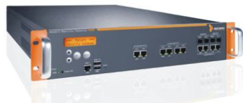
Astaro Security Gateway 525