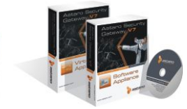
ASG Software & Virtual Appliance