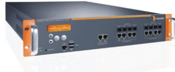
Astaro Security Gateway 625