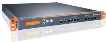
Astaro Security Gateway 425