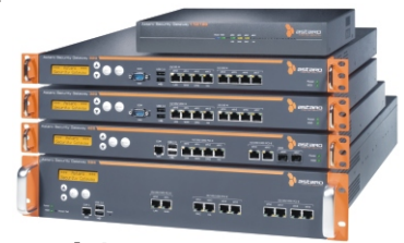
Astaro Hardware Appliances