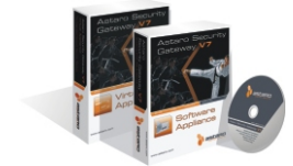
Astaro Software & Virtual Appliances